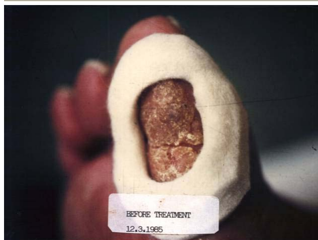
Figure 4 Recalcitrant plantar verruca prior to marigold therapy.

Tagetes ' effect on podiatric skin, bone, and nail conditions was further described by Khan and White followed by numerous randomized, double-blind placebo controlled studies on those conditions. 24