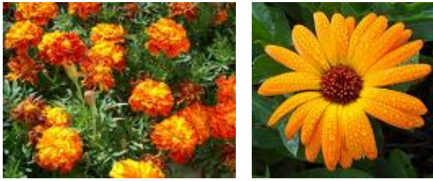
Figures 1ab The Tagetes (a) and Calendula (b) marigold species.

In contrast, the English pot Marigold ( Calendula species) has been described in the treatment of cuts, wounds and ulcerations as early as 1838. 13 More recently, anti-tumor and anti-oxidant properties of Calendula species have been established and utilized in researching treatments for various cancers. 14,15 This species has also been found to have hepatocytoprotective properties in the treatment of CCl 4 poisoning as well as anti-microbial properties. 16-18 In recent years, investigators outside the United States have studied the properties of the Calendula species in healing diabetic foot ulcerations. 19,20