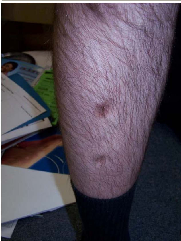
Figure 12 The resolved lesion.

No undermining was present, and there was no maceration of the wound edges. There was no purulence or malodor. The scars from the other pin tract sites were also examined and were labeled hypertrophic.