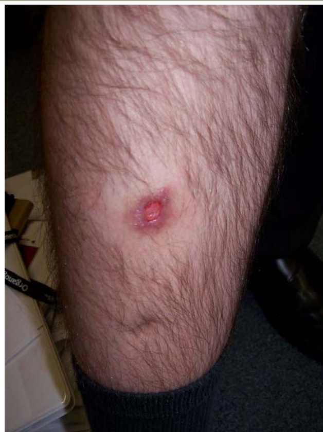
Figure 11 The lesion with decreased erythema and increased granulation tissue 48 hours after therapy.

A thirty year old Caucasian male presented with concern of an ulcer on the anterior right leg. The superficial wound was over the site of an external fixator pin tract scar, which had occurred fifteen years earlier. The injury was a result of a blunt blow on a coffee table, shearing off the hypertrophic scar. The patient reported bleeding globally across the lesion at the time of injury. He denied a personal or family history of family diabetes, hypertension, coagulopathy and peripheral vascular disease.