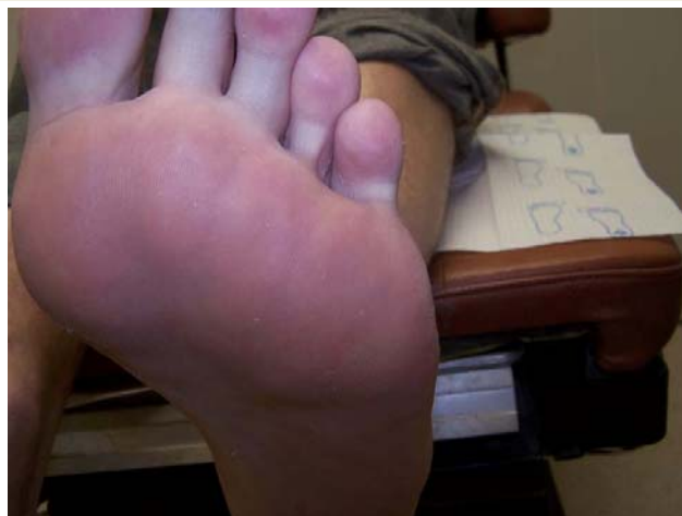
Figure 7 Clearance of mosaic verruca after four treatments.

Treatments range from topical to surgical and are typically painful. Marigold therapy can also be added to the many topical treatments for verrucae. (Figs. 4,5) Forty patients were randomly placed into one of four groups; active, placebo, active with pad, and pad only with no paste. 26 Patients were treated twice a week for two weeks and then used home therapy consisting of the tincture and ointment for four weeks. The lesion surface area pre-treatment and post-treatment was analyzed with a wound mapping system. Results showed that the active group had a significant difference in appearance, pain, and size compared with the placebo group.