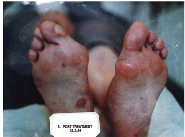
Figure 3 Clearance of lesions after four treatments; one month after initial therapy.

A marigold based paste has been used successfully as topical therapy for these lesions for many years in the United Kingdom. (Figs. 2, 3)