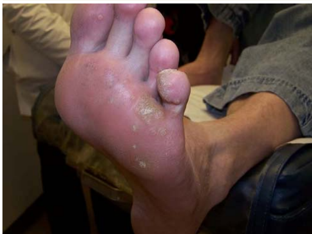
Figure 6 Immunocompromised patient with mosaic plantar verruca prior to therapy.