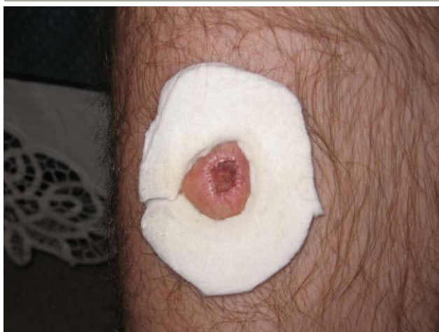
Figure 10 Anterior leg ulcer on initial presentation prior to marigold therapy.

They reported a statistically significant difference in reduction of total wound area compared with the control ( p < 0.05 ), showing an overall decrease of 41.71% in the experimental group compared with 14.52% in the control group. They conclude that application of Calendula extract significantly increases epithelization in chronic venous ulcerations.